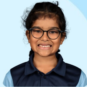
4 Ingle Rose