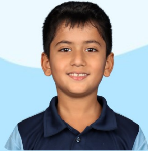
3 Brown Sarvad