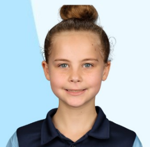
5 Thompson Poppy