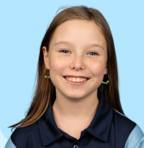
6 Mamouzellos Viola